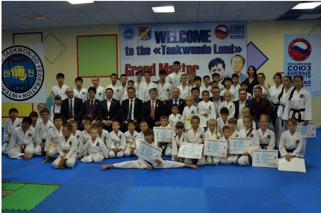
Sportsmen and honored guests