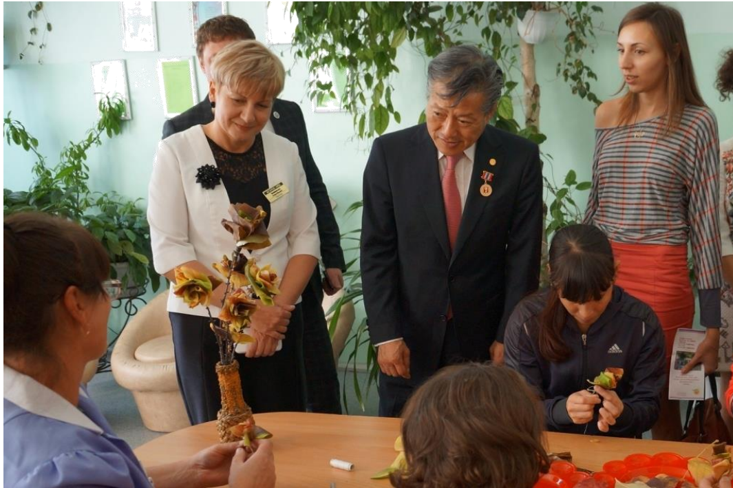
Meeting the Grand Master with students of URC