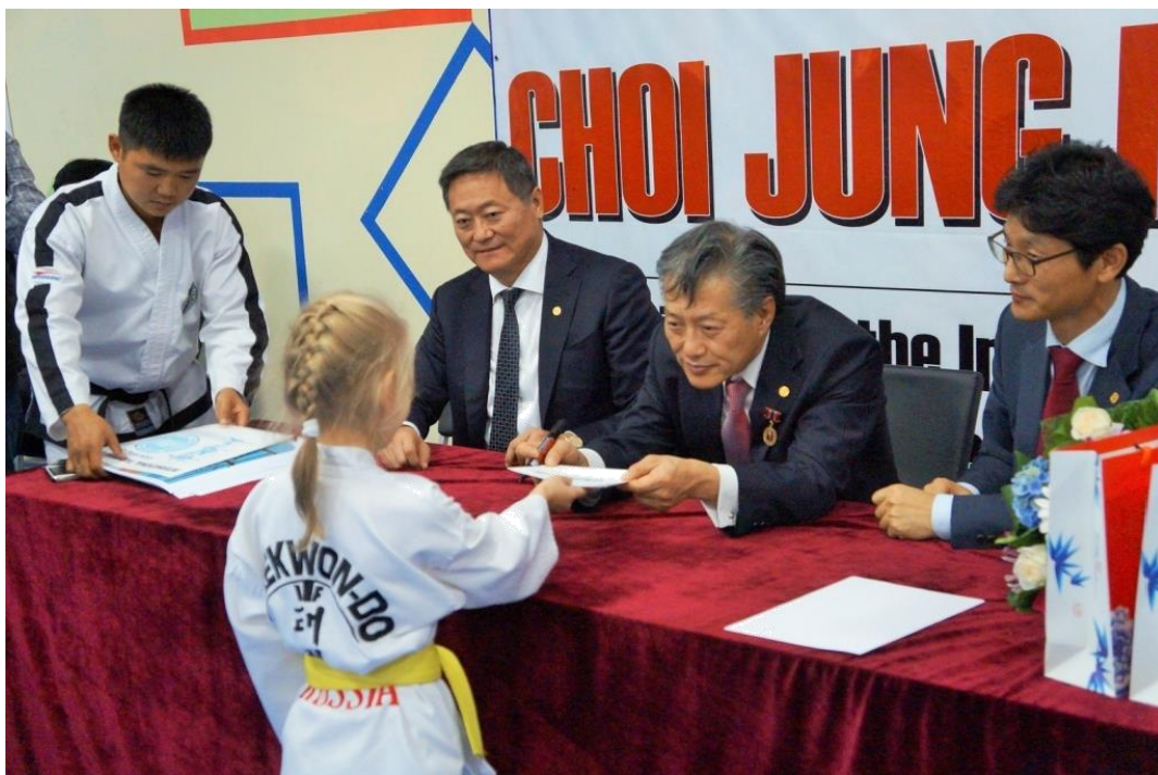
Autographs from the Grand Master